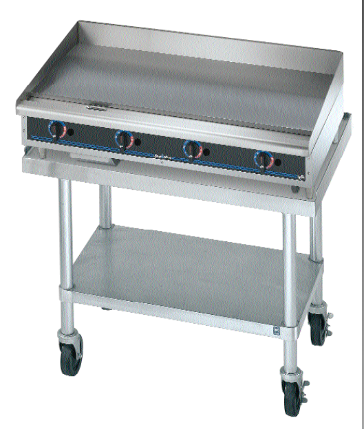
Model 648TD with Optional Equipment Stand